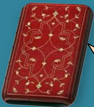
Original Book “Poems Chiefly Lyrical”